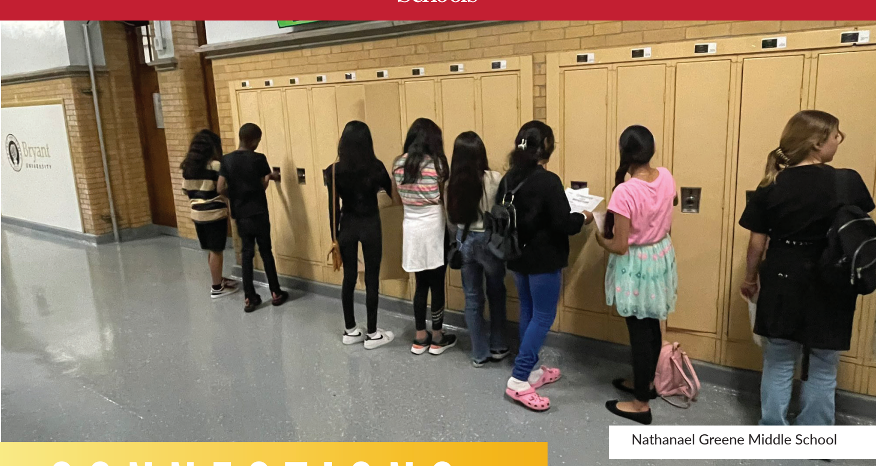
Nathanael Greene Middle School